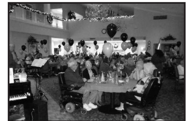
The dining room looked beautiful on New Year's Eve