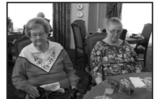
This is some of the Birthday girls for this month!